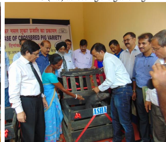
Distribution of developed pig variety to the farmers