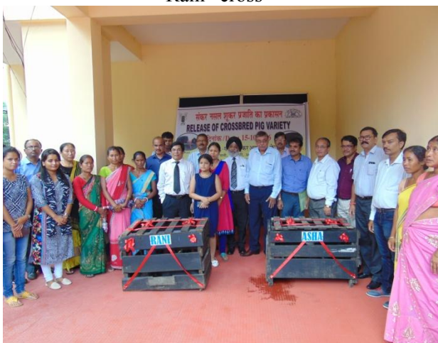
Release of “Rani” and “Asha”